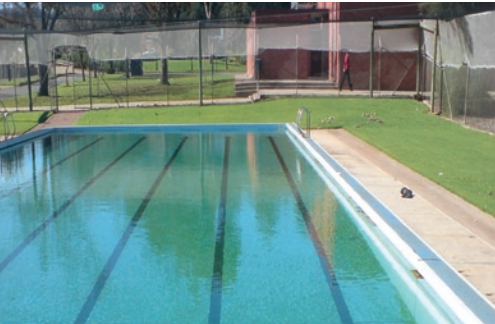
Image of pool prior to renovation - scum gutter to be cut & replaced with new wet deck, tiling & stainless steel ladders