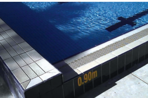
Image of renovated scum gutter to wet deck

The Urrbrae Pool's gutters were removed and replaced with a wet deck system on both sides. These measures enhanced the pool's aesthetics and helped with the conservation of water. Tiles then needed replacing along the pool sides and in other areas where years of wear and tear had taken their toll.