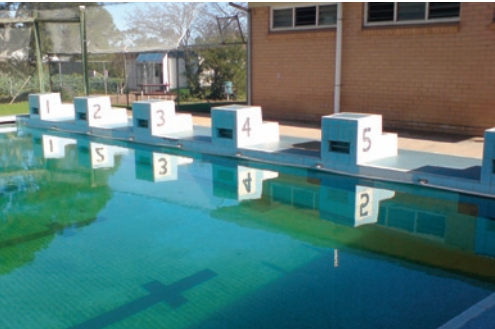
Image of pool with the old concrete starting blocks to be replaced with removable starting blocks

While we love building commercial swimming pools from scratch, often what's required is a major refurbishment of existing facilities. After an inspection of Urrbrae Agricultural College's 25 metre outdoor pool, Statewide Pools presented a proposal for works which was accepted by the College.