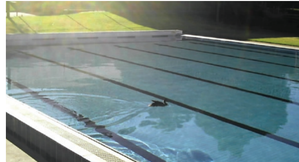
Completed swimming pool

Our stainless steel department then fabricated new ladders, expansion joints were resealed, existing starting blocks were replaced with convenient portable starting blocks and with the addition of new lane ropes, Urrbrae's $110 000 pool upgrade was complete.